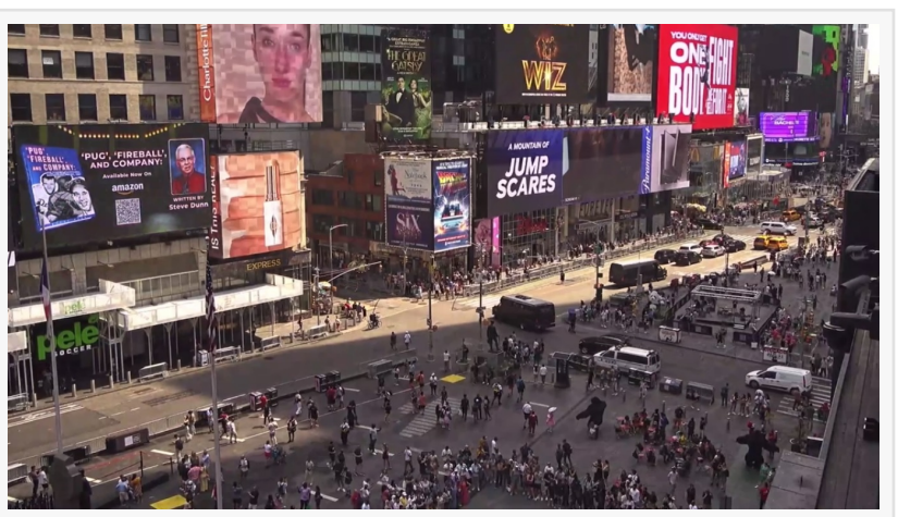
Pug, Fireball, and Company: 116 Years of Professional Baseball in Des Moines, Iowa Featured in Time Square