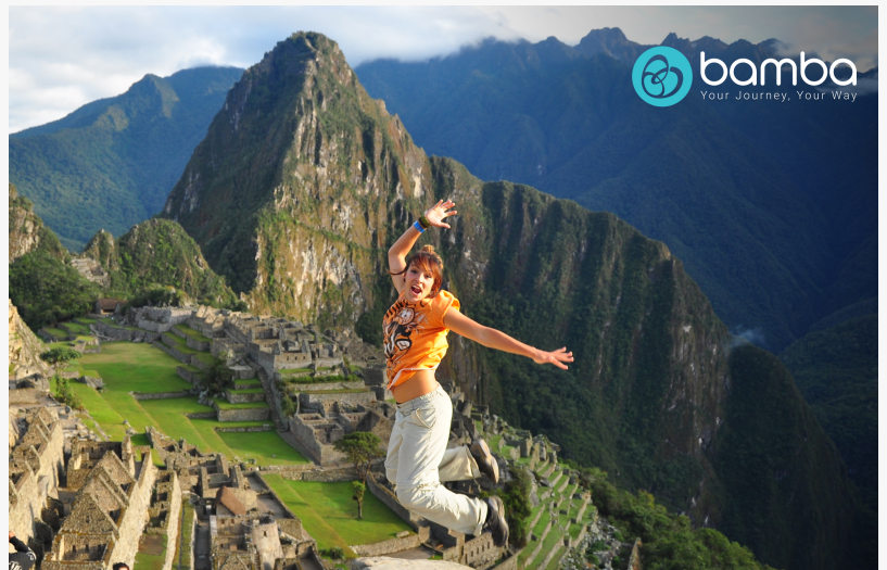
Happy Machu Picchu visitor from Bamba Travel