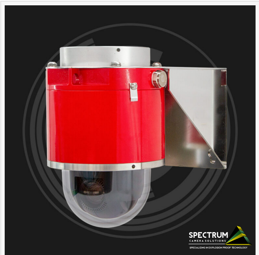
Ethane Certified Explosion Proof Cameras by Spectrum Camera Solutions