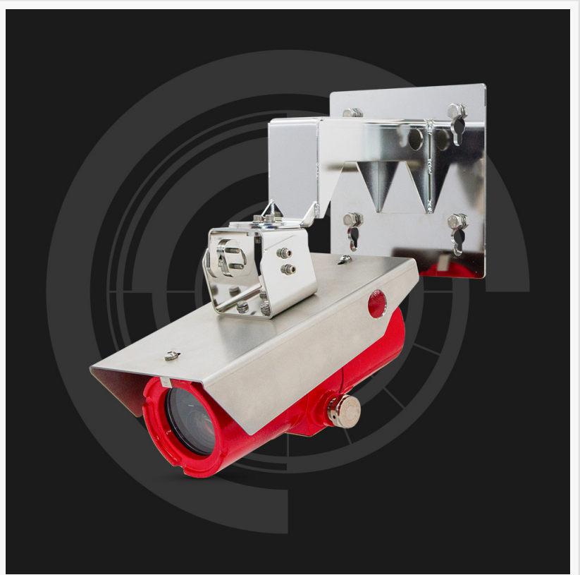
Explosion Proof Cameras by Spectrum Camera Solutions Fixed Series

Their participation in Navalshore 2024 is an excellent opportunity for attendees to explore these cutting-edge cameras and witness firsthand their exceptional features and capabilities.