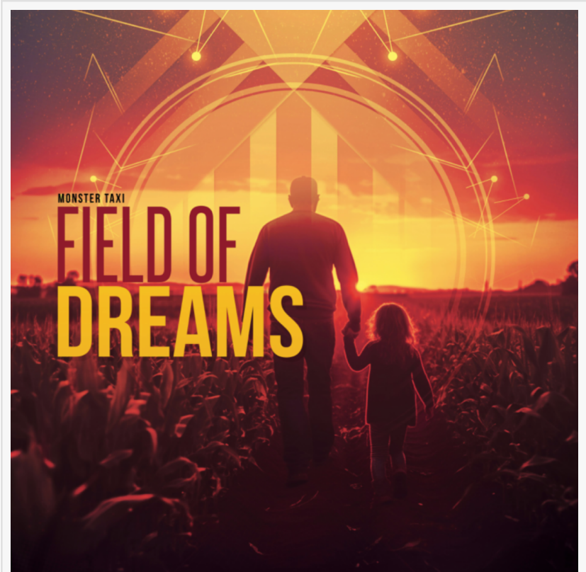
Monster Taxi "Field of Dreams" - cover art