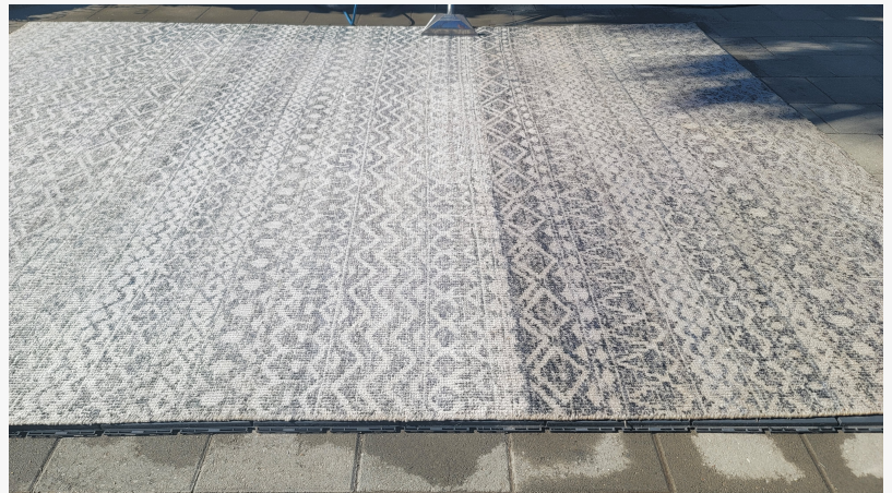
Rug cleaning a machine made rug, Tarzana, CA