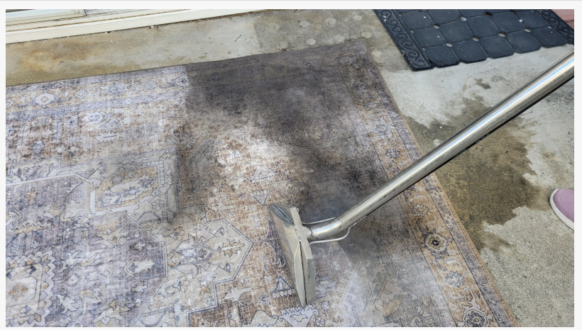
Cleaning a Persian Area Rug

In addition to cleaning, JP Carpet Cleaning Expert Floor Care offers expert repair and restoration services for damaged rugs. Over time, rugs can suffer from fringe damage, holes, and wear and tear, particularly in high-traffic areas. The skilled technicians at JP Carpet Cleaning Expert Floor Care are adept at restoring these rugs to their former glory, extending their lifespan and preserving their value.