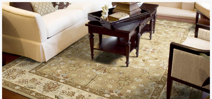
Wool Rug cleaning Tarzana