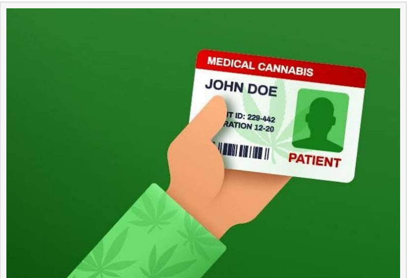
Medical Marijuana Card