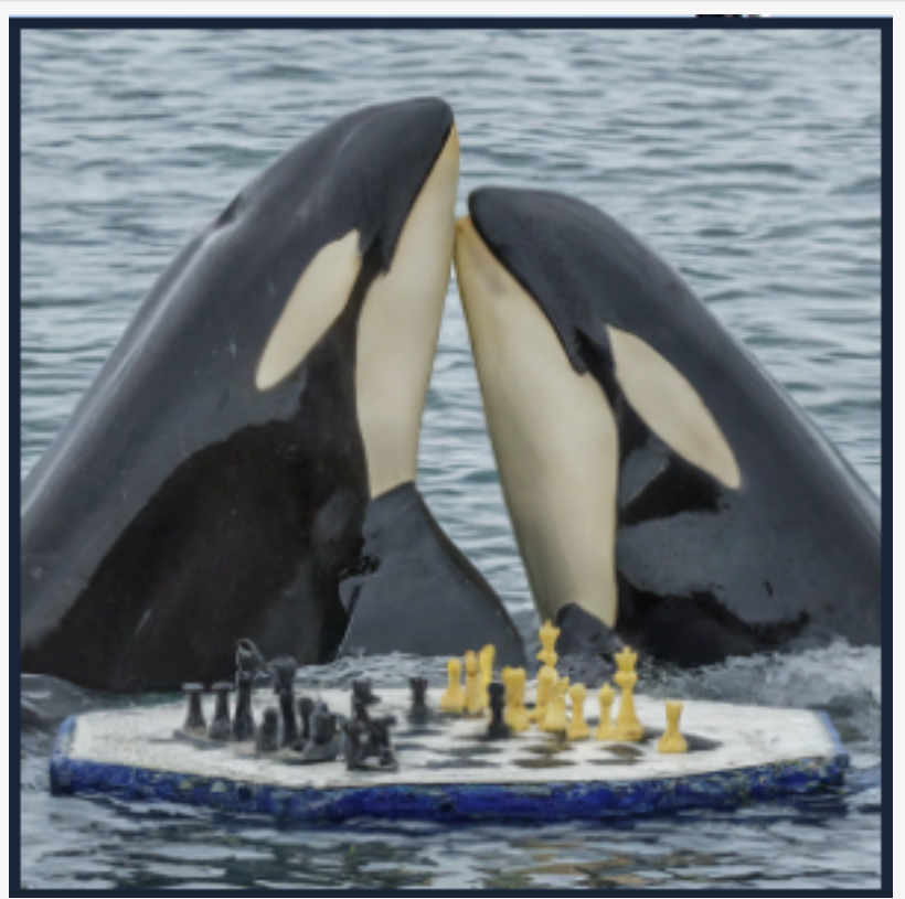
A Whale of a Good Time!

About the Silverdale Library: The newly renovated Silverdale Library is dedicated to fostering a