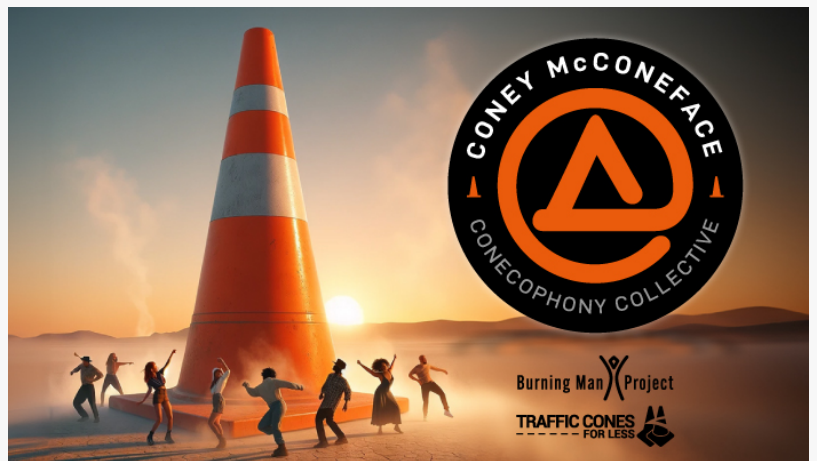
ConeyMcConeFace Burning Man 2024

BLACK ROCK CITY, NEVADA, USA, August 9, 2024 /EINPresswire.com/ -- Traffic Cones For Less , the nation's number one leader in event-branded and artistically creative cone creations, along with its parent company OES Global , are thrilled to announce their contribution to the playful and iconic Coney McConeface installation at this year's Burning Man festival.