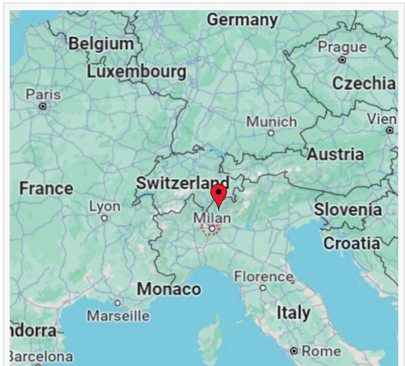
Singota Solutions New State-Of-The-Art European Location

Singota Solutions is a CDMO dedicated to overcoming obstacles in the drug development