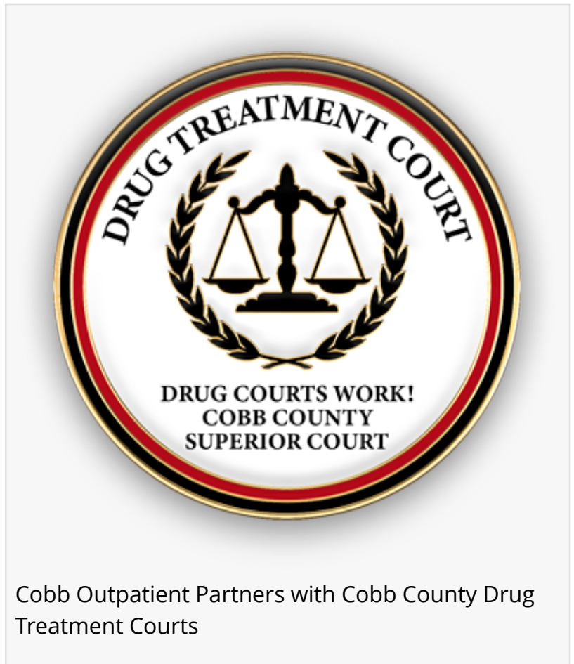
Cobb Outpatient Partners with Cobb County Drug Treatment Courts

The detox services offered through this partnership will follow an innovative outpatient treatment model. This approach allows patients to receive addiction treatment while continuing to work and attend to their life responsibilities. By providing flexible and comprehensive care, Cobb Outpatient Detox ensures that participants can pursue recovery without disrupting their daily lives.