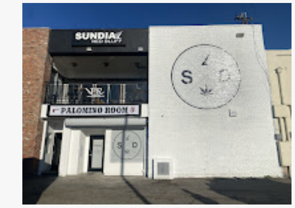
weed dispensary in red bluff

Everyday Sundial Deal: Buy 3 3.5g products over $50 and get the 4th for just $1. This offer applies to all products within the same category, such as flower or edibles, with some exclusions.