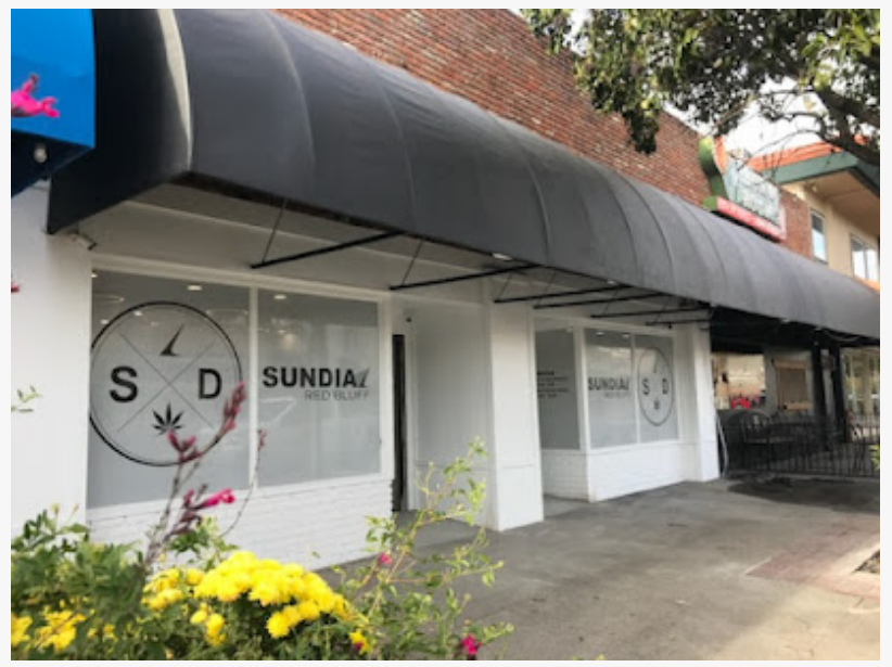
sundial collective red bluff weed dispensary

This <u>weed dispensary in Red Bluff</u> offers daily deals to ensure that their customers can enjoy premium products at competitive prices.