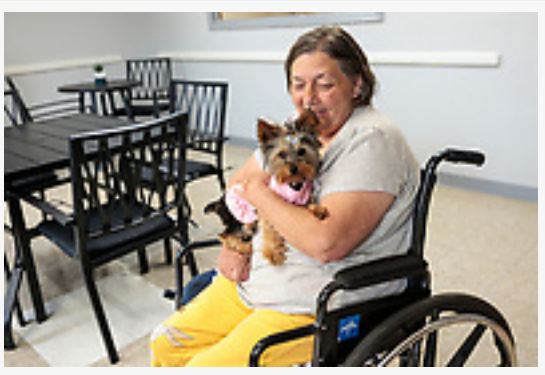
A resident enjoying Keisha's Korner, for some puppy cuddles.