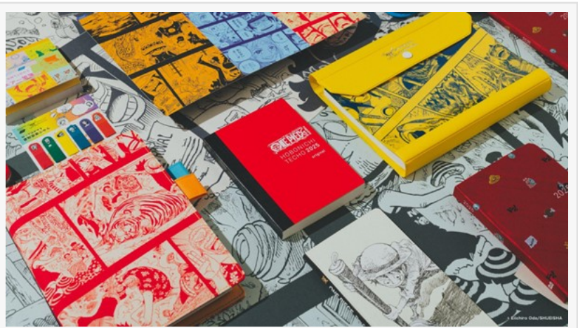
Hobonichi Techo 2025 Edition