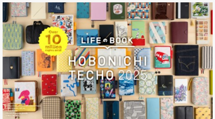
Hobonichi Techo 2025