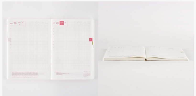
Hobonichi Techo 2025 English Planners

*Data compared 2023/09 – 2024/05 vs. 2022/09 – 2023/05.