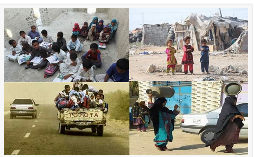
According to the Iranian regime statistics, Sistan and Baluchestan are by far the poorest provinces in Iran. In many images from this place, it seems as if time has stopped, and there is no sign of development or progress. The life condition in this area is so painful.

PARIS, FRANCE, August 7, 2024 /EINPresswire.com/ -- The National Council of Resistance of Iran (NCRI) Foreign Affairs Committee in an article published that according to the Iranian regime's statistics, Sistan and Baluchestan are by far the poorest province in the country. In many images transmitted from this province, it seems as if time has stopped, and there is no sign of development or progress. One can then imagine the condition of the people not in the