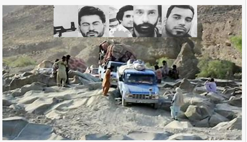
These numerous incidents of death are the result of the regime, which continues to oppress the impoverished people of this area. The ongoing killings of fuel porters, whether in road accidents or by direct gunshots, highlight the regime's systemic oppression.

They describe "the destruction of people's homes in Baluchistan" as "a lever of pressure in both the Shah and Sheikh regimes." They promise that "darker days are ahead for the regime, and the countdown has begun."