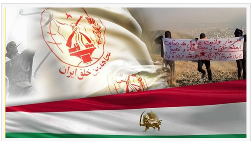
The Resistance Units, as supporters of the PMOI, are braving severe consequences from the Iranian regime for their bold actions. The regime has a long history of cracking down on PMOI being its primary target. The resistance Units slogan is"No to Shah no to mullahs,"

These fuel porters either perish in accidents or fall victim to the bullets of