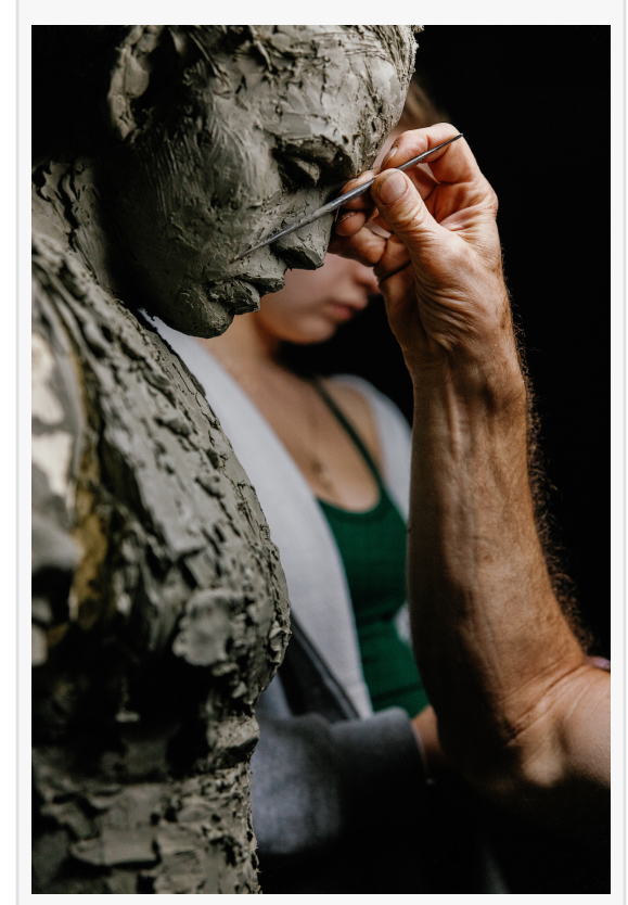
Sabin Howard sculpting the Final Daughter