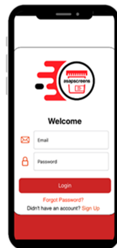
asapscreen app mobile screen