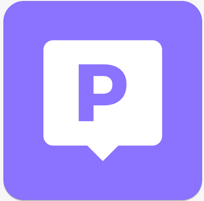
PopChar Logo Windows

PERG, UPPER AUSTRIA, AUSTRIA, August 8, 2024 /EINPresswire.com/ -- ergonis Software proudly announces the launch of PopChar 10 for Windows, setting new standards in character and font management for Windows users. Following the successful release of PopChar 10 for Mac in March, this latest version for Windows introduces numerous new features and enhancements, cementing PopChar's status as an essential tool for anyone working with fonts and special characters.