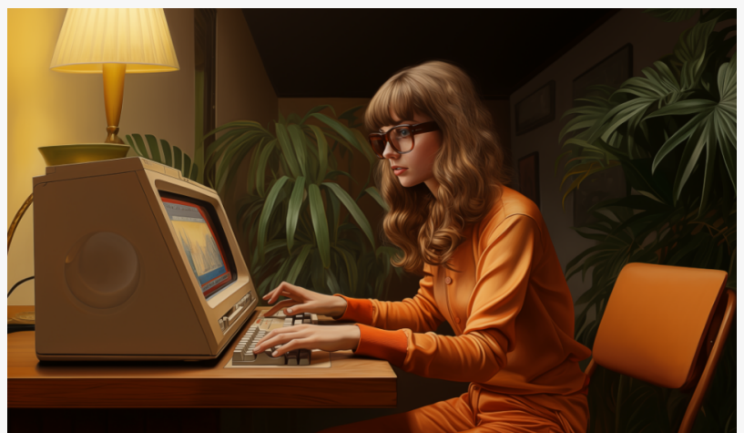
Building a Brand Online: Essential Tips from Digital Marketing Experts