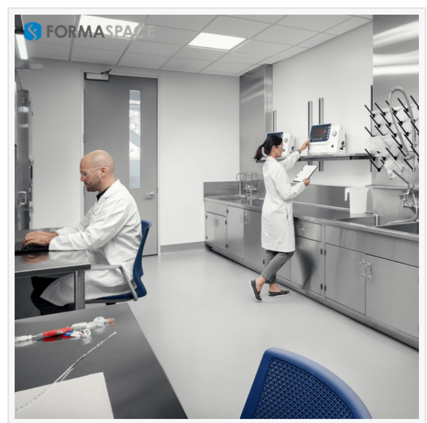
Shown above is a blood laboratory featuring a seamless 24-foot-long stainless steel countertop built for a medical device research center.

In 2012, Courtine took a position with the École Polytechnique Fédérale de Lausanne (EPFL), eventually establishing his own research laboratory, known as the G-LAB.