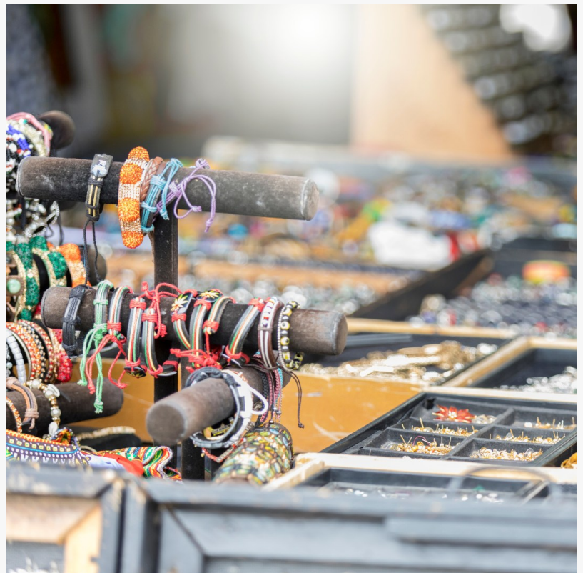
handmade jewelry vendor at the art festival