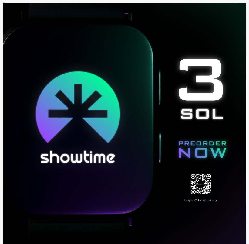
Showtime Watch is currently priced at 3 $SOL.