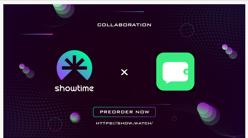
Showtime is working with SocialFi platform DeBox

DeBox, on the other hand, has experienced unprecedented growth, surpassing 10 million users and securing a top spot in Korean Apple