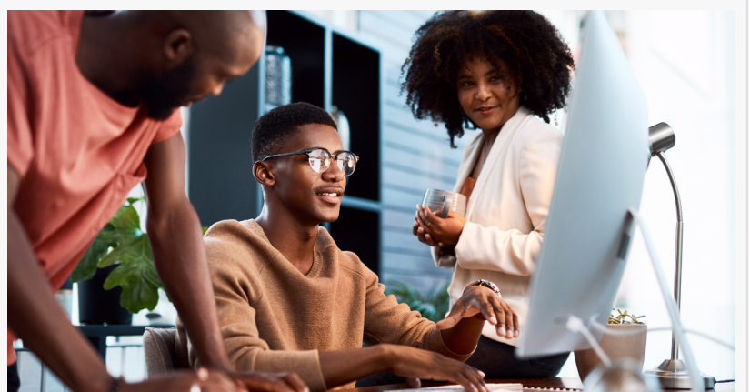
Resources for Black-Owned Businesses

SACRAMENTO, CALIFORNIA, UNITED STATES, August 9, 2024 /EINPresswire.com/ -- We Thrive Above and Business Departments AI Empower Black Entrepreneurs with 500 Free Subscriptions Each During National Black Business Month