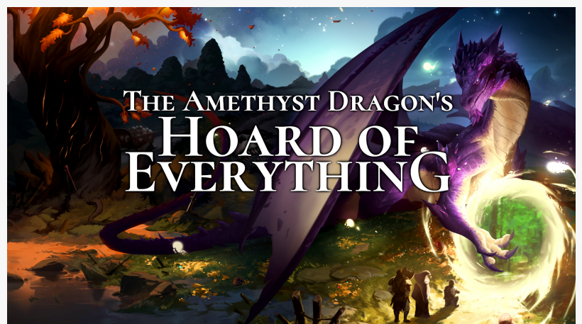
The Amethyst Dragon's Hoard of Everything

The Amethyst Dragon's Hoard of Everything contains more than 1,700 game options and ideas for players and Dungeon Masters, all designed to be used with the 5th edition of Dungeons & Dragons .