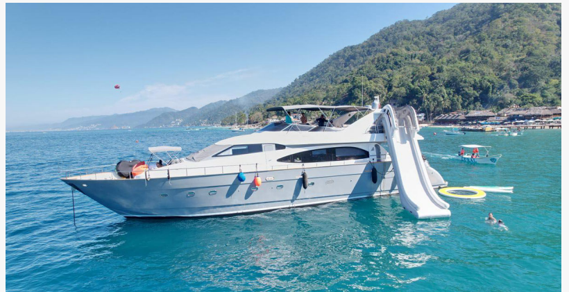
85' Azimut - Luxury Yacht - A Client Favorite

This press release can be viewed online at: https://www.einpresswire.com/article/734121501