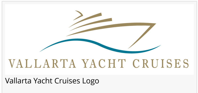
Vallarta Yacht Cruises Logo

company now offers multi-day private yacht charters , presenting an alternative to traditional hotel accommodations in the region. These yacht charters provide an immersive and flexible way to explore the beauty of Banderas Bay and the surrounding coastal areas.