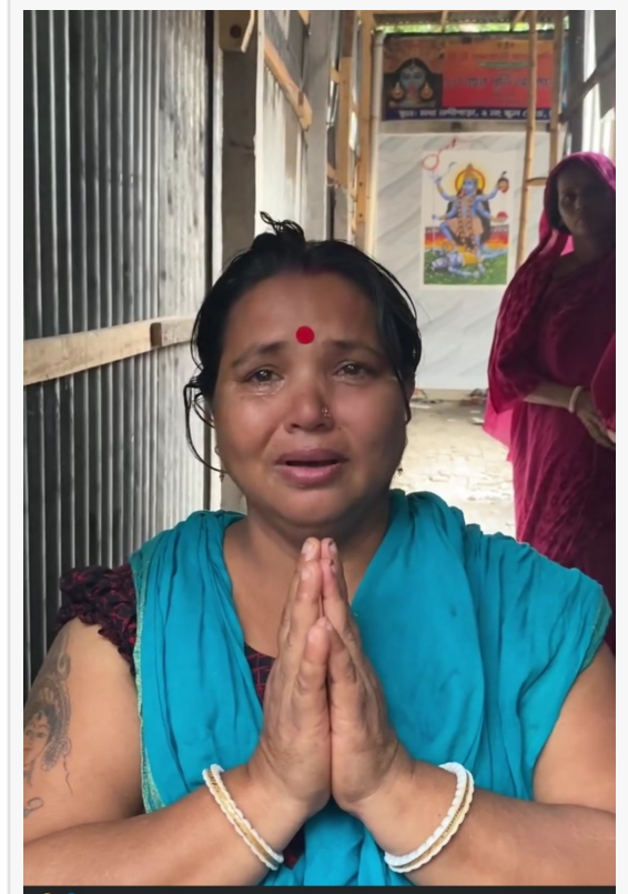
Her family is under threat and her husband is hiding, in Bangladesh

In these African countries, Islamic militants who aim to establish Sharia law massacre or severely abuse Christians and moderate Muslims. Islamist raids in Africa mirror the October 7th pogrom against Jewish communities in Israel: mobs storming "infidel" villages, screaming "Allah Akbar," murdering innocents, raping and kidnapping women and girls who will become concubines, burning and torturing family members in front of their families who are forced to watch.