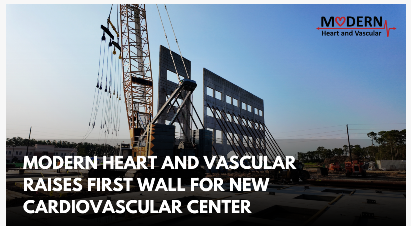
Modern Heart and Vascular Institute Starts Construction on New Building