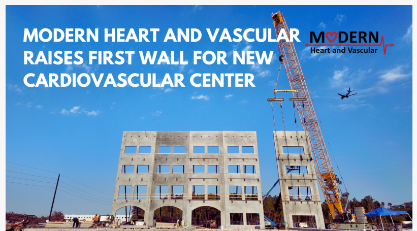
Modern Heart and Vascular Raises First Wall for their New Building

The project, developed in partnership with Houston-based Brown McGregor Architects and Arch-