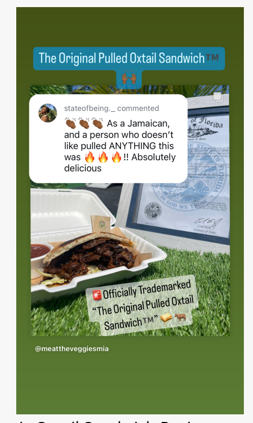
Organic Oxtail Sandwich Review