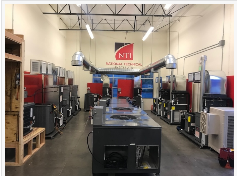
NTI HVAC Training Lab

Established in 2003, NTI is a state approved trade school with campuses in Las Vegas, Phoenix and Houston offering fast-track training in HVAC, plumbing and electrical. NTI’s mission is to produce problem solving, creative thinking graduates who possess industry-standard knowledge and skills for a long-term, promising career. NTI offers both in-person and hybrid training