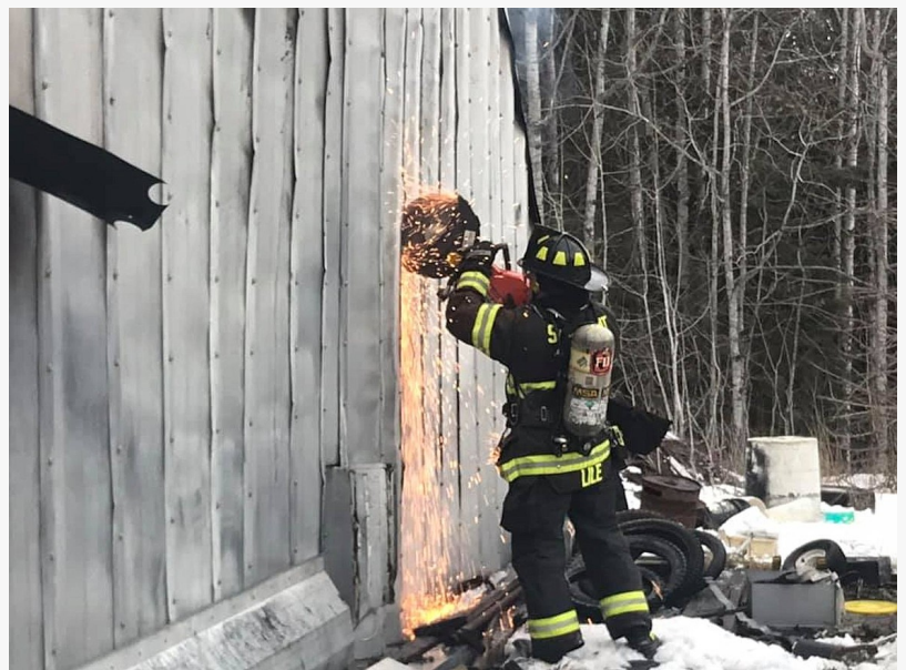
The AP (ALL PURPOSE) 007 FIRE AND RESCUE BLADE BEING USED IN THE FIELD

From Devour Tools, Ty Whitacre echoes this sentiment, expressing, "Our partnership with Noble