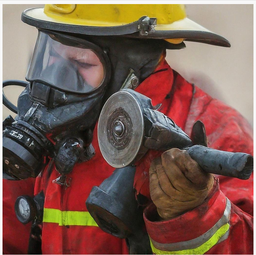
The AP 007 Blade cuts faster and can be used on many hard materials including steel

Noble's introduction of the AP diamond blades into the emergency services toolkits is a significant advancement, reflecting a commitment to equipping personnel with the best tools available.