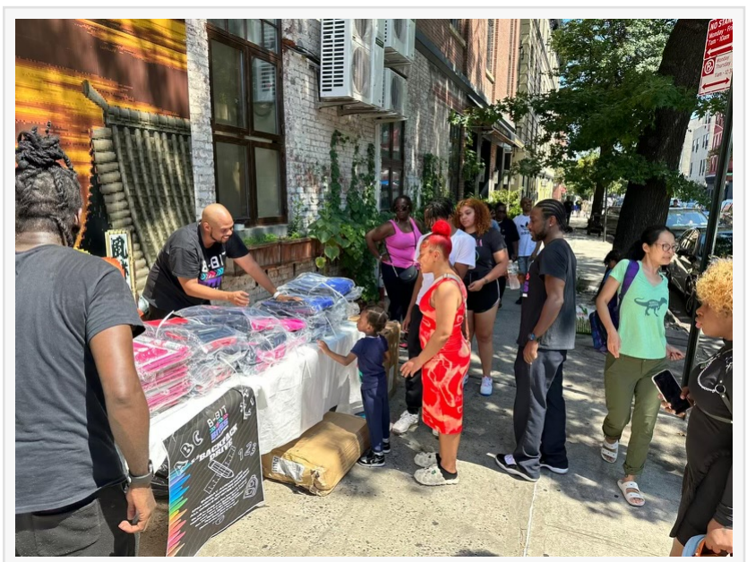
Our Team hard at work passing out backpacks at last vears drive

In collaboration with over 40 small business sites across New York, including prominent local businesses such as 7th Street Burger, Brain Food The Smart Kitchen, House of Wings, Poetica Coffee, Yemen Cafe, Ayat, Al Badawi, Marlow Bistro, Chefscape Food, Rethink Food, Burgers on B, Smokers Depot, Audiological Diagnostics, Castle Hill Drugs, Redfern Drugs, and Fredrick Pharmacy - the drive will make it convenient for families to pick up supplies at various locations. Each participating site is