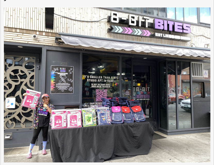
Another storefront giving out bags to happy kids in NYC!