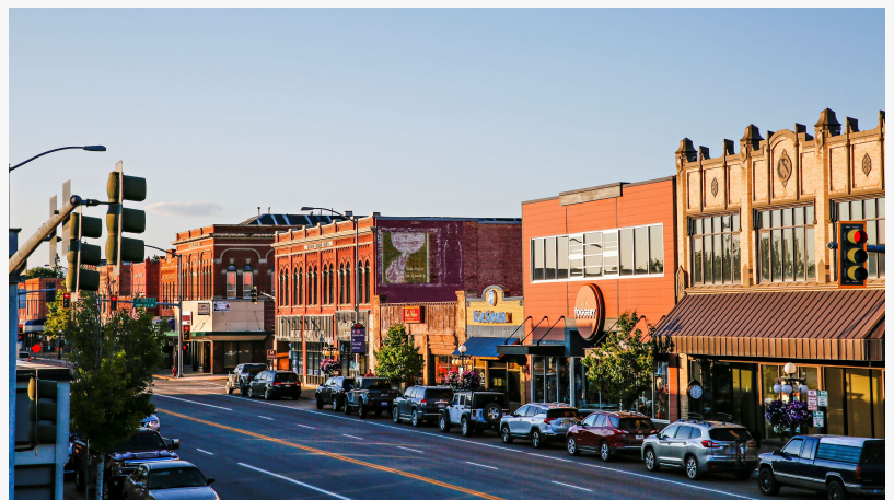
Historic buildings and local businesses line Main Street in Kalispell, Montana.