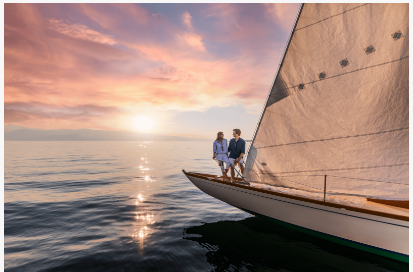
Set sail on Flathead Lake with a private sailing charter.

KALISPELL, MONTANA, USA, August 14, 2024 /EINPresswire.com/ -- As continued inflation has many consumers tightening their belts when it comes to spending, many Americans continue to invest in experiences, including travel and entertainment. In Kalispell , Montana, consumers can combine affordable lodging stays with luxury experiences.