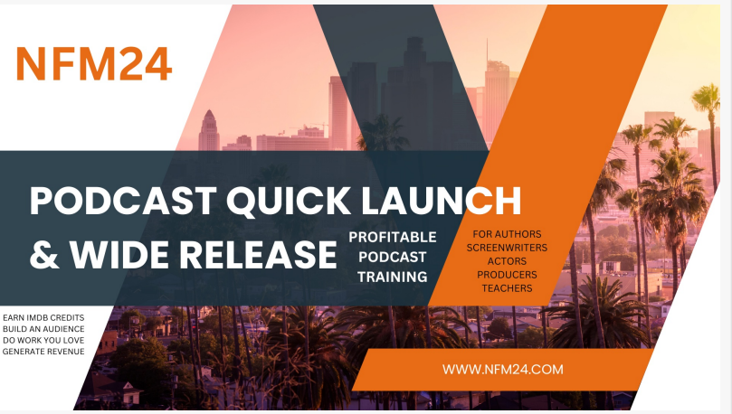
Learn How to Create a Great Podcast and Launch it Worldwide Fast