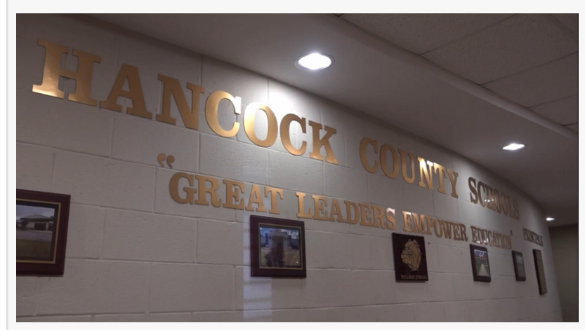
A guiding principle displayed in Hancock County Schools.