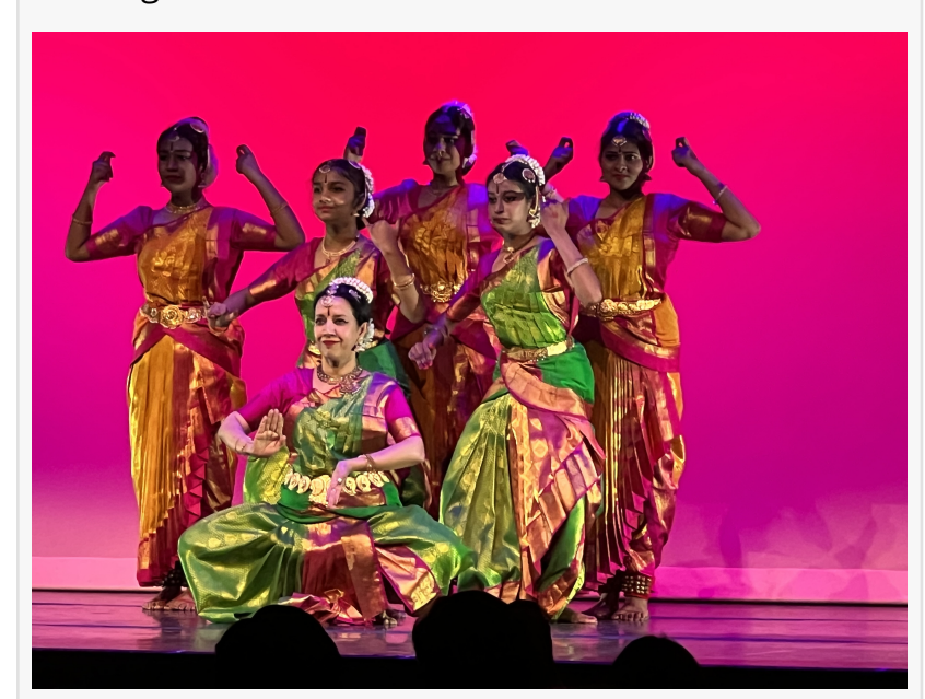
Soorya Foundation - 2023 Indian Dance Fest

This press release can be viewed online at: https://www.einpresswire.com/article/734779645