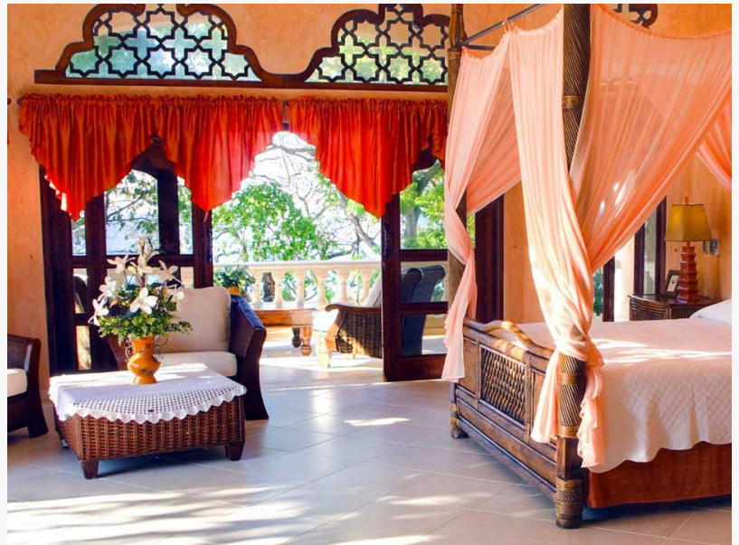
The Royal Suite at Balaji Palace, offered at auction by G3 Auctions