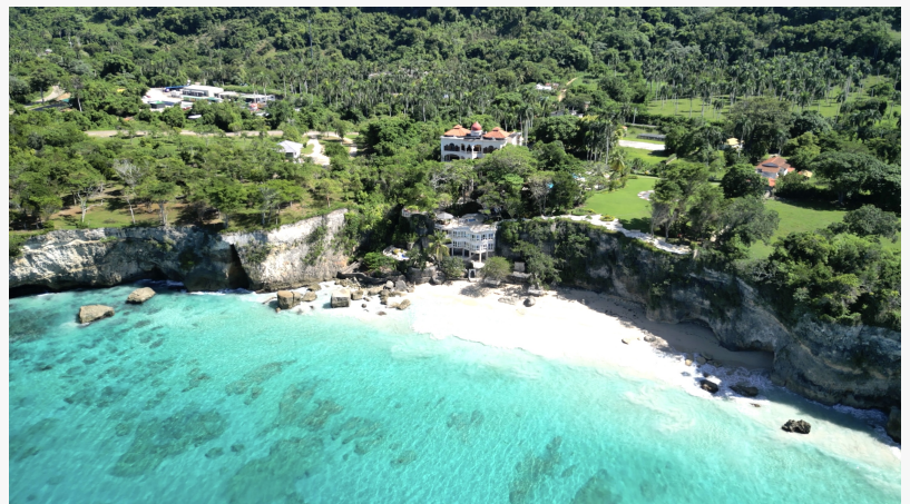
Balaji Palace offered at auction by G3 Auctions