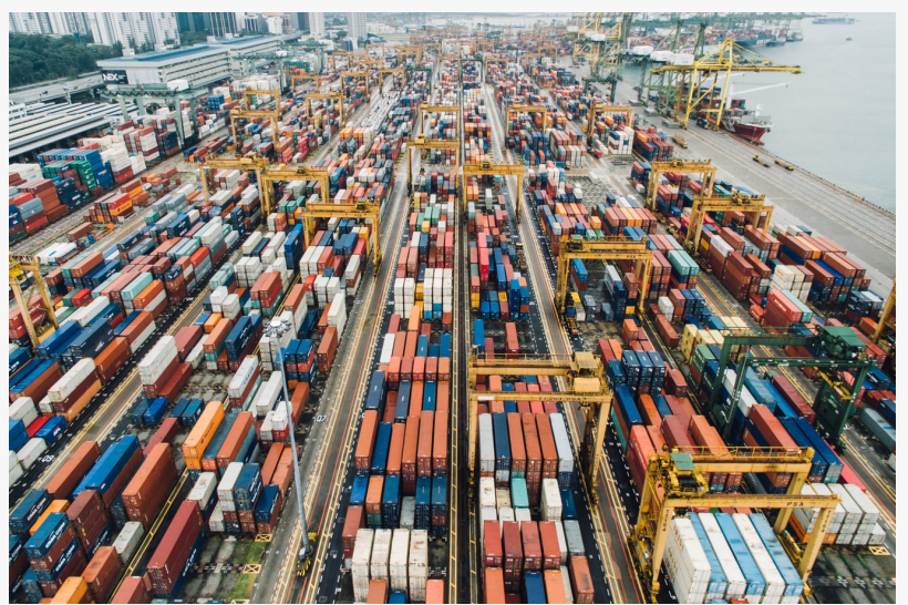
bank guarantee provider