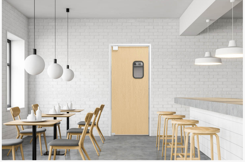
Choose from nearly unlimited options to design your perfect double-acting door system.

Beyond our stock and special anodized finishes, we offer standard and custom paint colors, Vision Lite Kit options with acrylic windows, and accessories like push plates and kick plates.