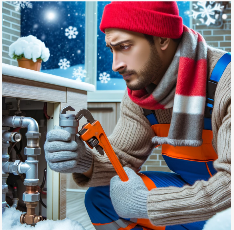
Illustration of freezing pipes