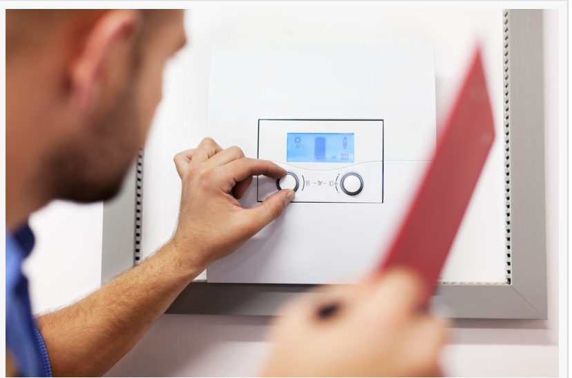
Tankless Water Heater Installation in Tucson

Contaminants such as lead or bacteria can pose serious health risks, particularly to young children and the elderly. Regular testing and the installation of appropriate filtration systems can help protect against these risks.