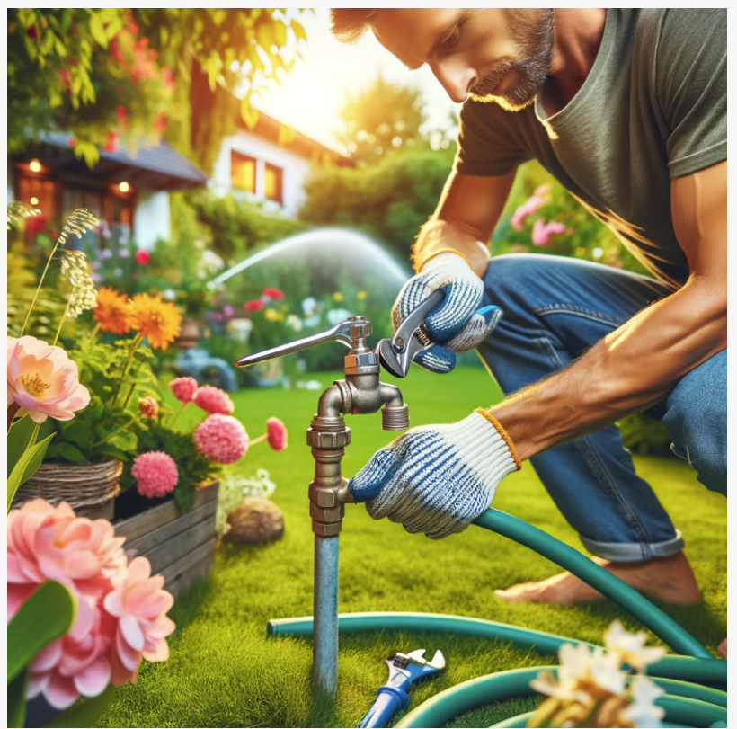
Intelligent Design Air Conditioning, Plumbing, Solar, & Electric Plumbing Repair in Tucson

Maintaining a well-functioning plumbing system is crucial for preserving the value of a home. Potential buyers are likely to be deterred by signs of plumbing issues, such as water stains, mold, or outdated fixtures. By investing in regular inspections and timely repairs, homeowners can