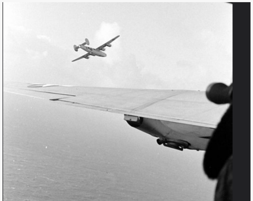
On the Wing - Overwing