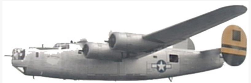
On the Wing - B24