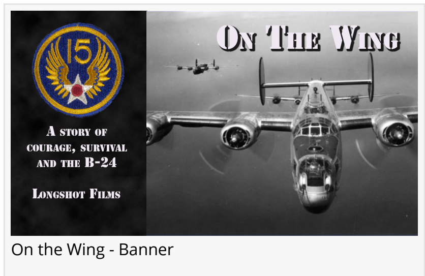
On the Wing - Banner

Availability/Price: Video on Demand/VOD release is available on major platforms including Amazon Prime Video, Vimeo on Demand, GooglePlay and more. Price varies by format, own-rent option and platform.