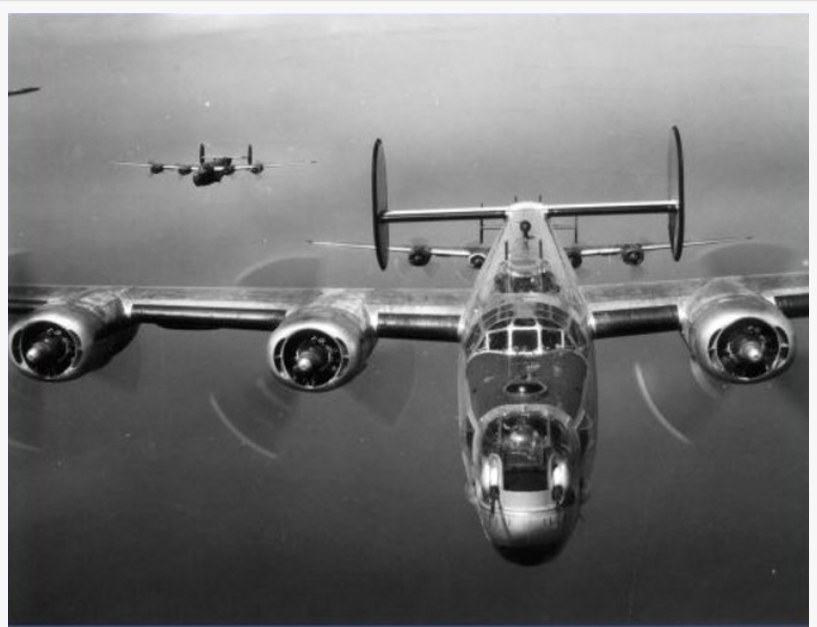
On the Wing B-24 in flight