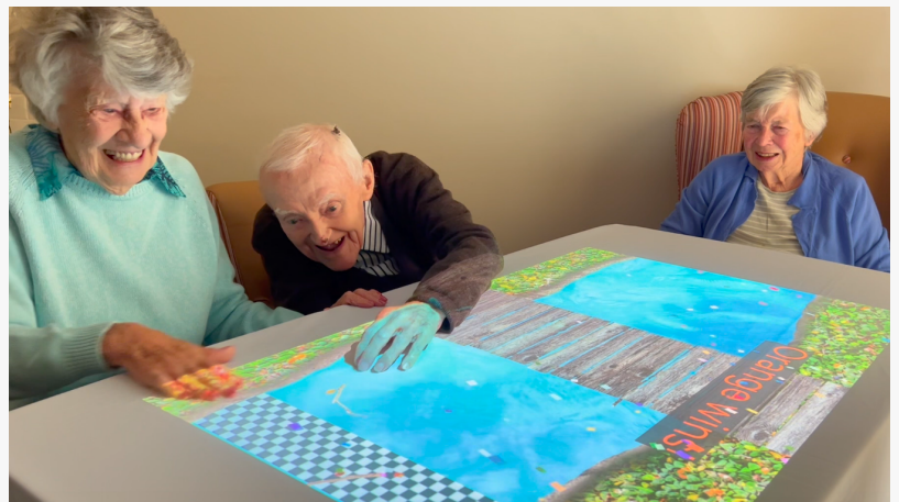
Older adults with memory disorders enjoy playing interactive games through the Happiness Programme.