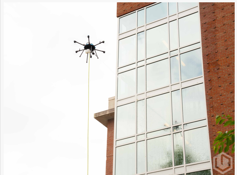
Lucid Bots Sherpa Drone Cleaning the Exterior of a University Building.