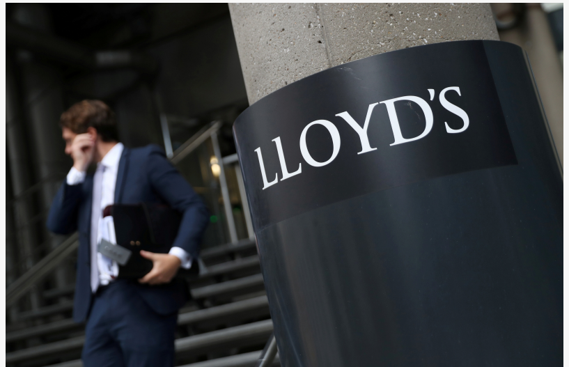
Ukraine Response is backed by Lloyd's, including war risk insurance

LONDON, UNITED KINGDOM, August 14, 2024 /EINPresswire.com/ -- One year ago, global risk advisory firm, Inherent Risks launched a Lloyd's and company market-backed medical evacuation and crisis response membership product under the brand of UkraineResponse.com enabling organisations to fulfil an essential part of their duty of care obligations for expatriate and in-country national staff.