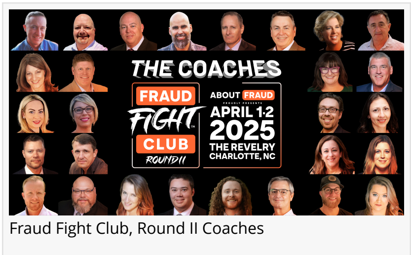
Fraud Fight Club, Round II Coaches

it: 'Fraud is an issue which ultimately affects human beings, and FFC reflects this. It is a gathering of professional fraud fighters inspired to share the most innovative methods of combating financial crime to help protect not just their businesses, but their customers from financial loss and human suffering. When you paint fraud fighting in that light, you inject purpose and passion into the fight.'