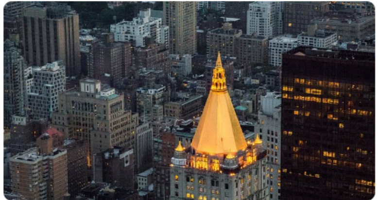
The New York Life Building

"Existing Conditions is one of the country's premier visualization firms," Schaff continued. "This acquisition means we can put our considerable resources behind their outstanding work. It also means we effectively double the size of our 3D Laser and Mapping & Modeling Teams, allowing us exponentially more reach to Intelligently Visualize The Built World for our customers." ®