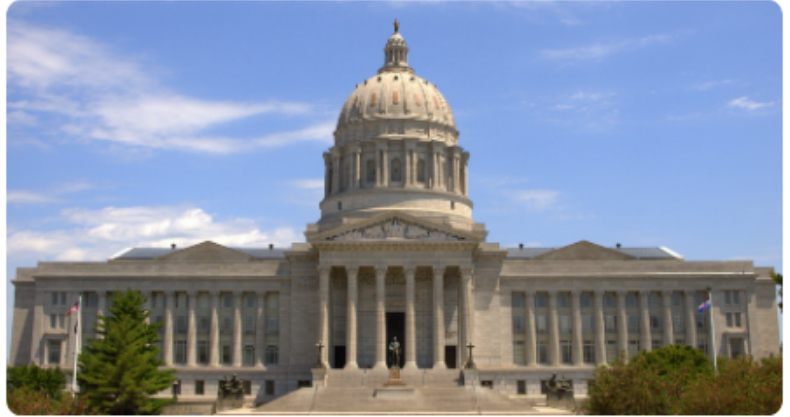
Missouri State Capitol

Documented accurate as-built data for Missouri State Capitol