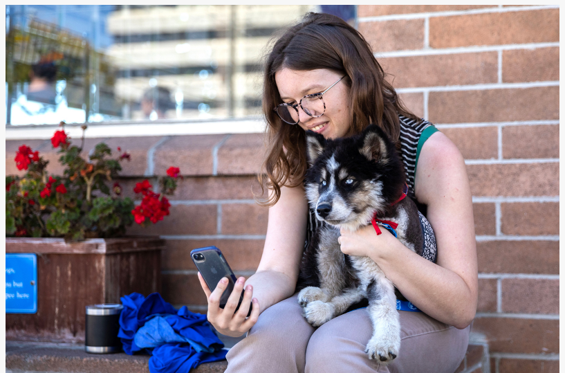
Adopters connect with pets at Berkeley Humane's largest adoption event, helping over 200 animals find loving homes on September 7th.

This family-friendly event will include pet toymaking for kids, live music, food trucks, vendors, and a beer garden sponsored by Cellarmaker Brewing Company. Berkeley Humane will waive adoption fees for this event, and many rescue partners will also waive or reduce their fees. All animals available