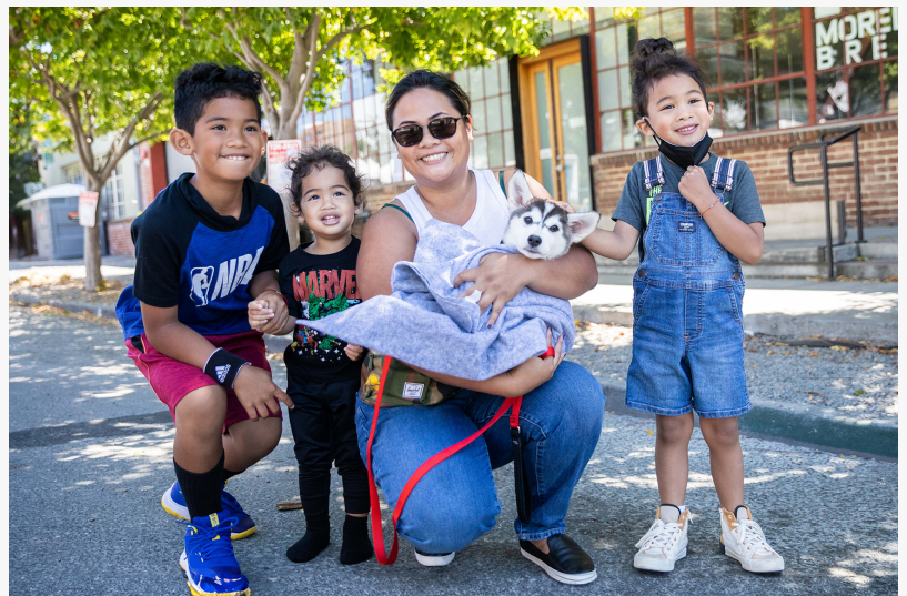
Excitement fills the air as a family poses with their newly adopted puppy at Berkeley Humane's Bark and Meow Around the Block event.