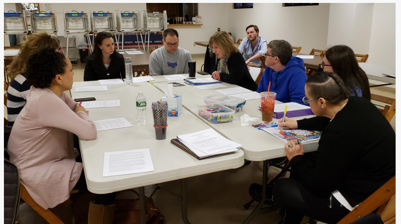
Wellness Workshop Table