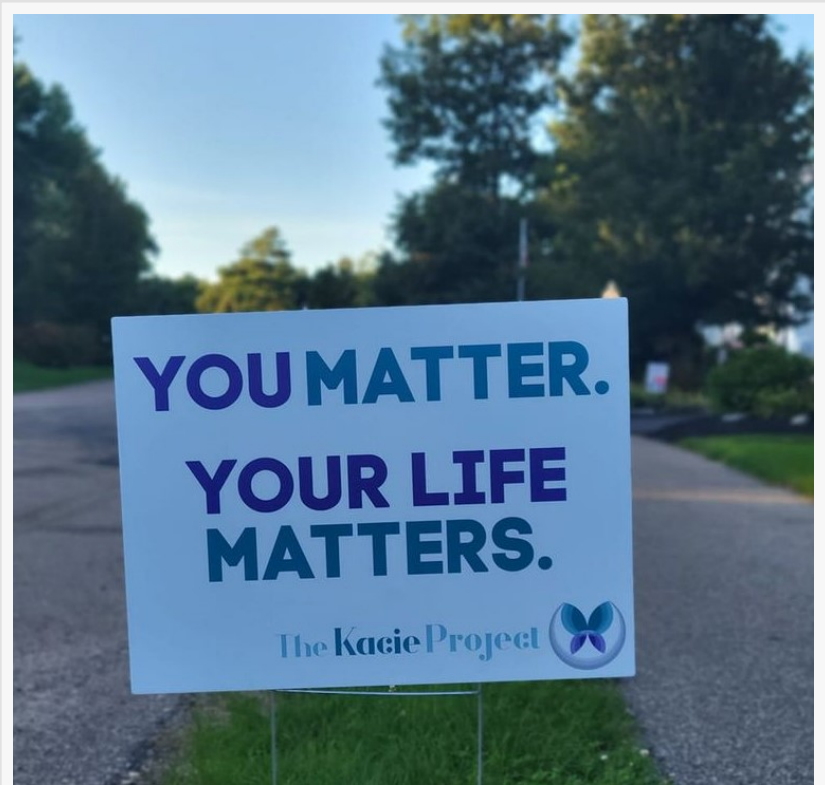
Three simple and powerful words

On Saturday, August 17th, a small group of advocates from the Kacie Palm Project, a Taunton based nonprofit, and the MCSP Bristol County Suicide Prevention Coalition will introduce the community to a new wellness workshop titled Lifting Spirits that weaves together concerns around suicidal ideation and also the emotional stress of isolation and loneliness.