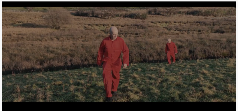
DAY OF THE CLONES - Film Still 1