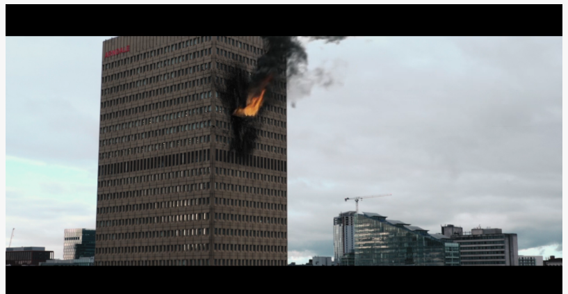
DAY OF THE CLONES - Film Still 4