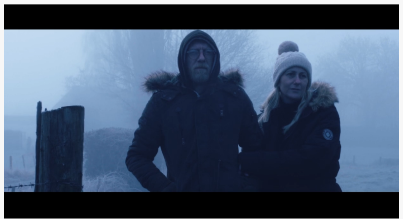
DAY OF THE CLONES - Film Still 2

FULL SYNOPSIS: The near future. Human clones are ruthlessly exploited for manual labor. They are sterile and programmed to obey, so when they rebel human society is totally unprepared. As civilization falls, geneticist Andrew Callwood and his pregnant girlfriend Lindsey flee to a remote farmhouse. Together with their android Kellogg they turn the homestead into a fortress. But it's not long before they pick up strays in the form of a bitter soldier, Solent, and a lazy young couple, Sam and Laura. A series of deadly encounters with patrolling clones convinces the survivors they must get help from the outside world. Andrew resists the idea. He prefers to wait