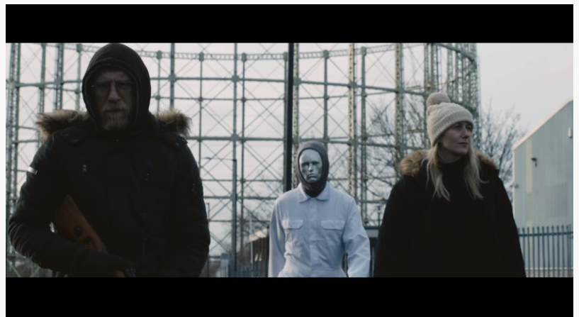
DAY OF THE CLONES - Film Still 3