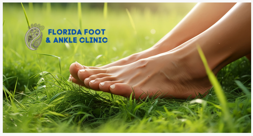
Experience Healthy Foot by Florida Foot and Ankle Clinic

Petersburg, and Clearwater, the clinic has grown to be associated with knowledgeable diagnosis, creative treatment, and compassionate patient care. Renowned for their knowledge of a variety of foot and ankle disorders, including plantar fasciitis, bunions, ingrown toenails, and more, the clinic's podiatrists' method addresses the underlying reasons as well as the symptoms to stop recurrence and advance long-term foot health. Also, Laser Nail Therapy is now available by the specialist in the clinic. They are