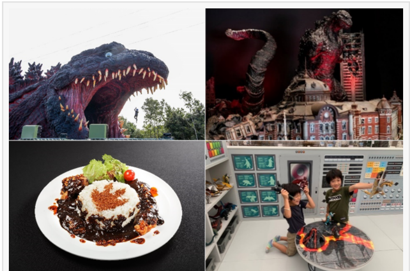
Godzilla Interception Operation