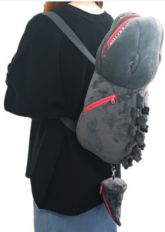
Godzilla backpack, exclusive to Nijigen no Mori

The attraction features the world's first permanent Godzilla museum, as well as "Kaiju no Mori", an indoor area for young children to enjoy free play with around 50 different kinds of kaiju soft plastic models. There is also a range of NIGOD merchandise and special Godzilla-themed food and drink available for purchase. Find the world's largest Godzilla making landfall on Awaji