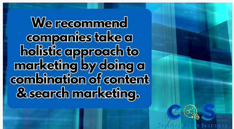
Top-Notch Finance Industry Marketing Approach