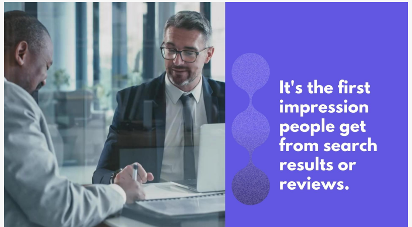
First impressions online matter in the Finance Industry