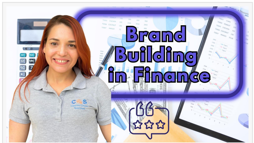
Brand Building in Finance